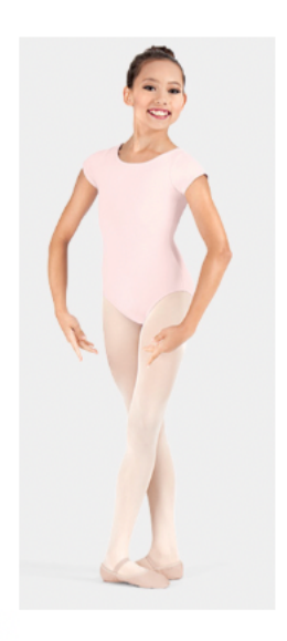
Light Pink Short Sleeve Leotard (Suggested brands are